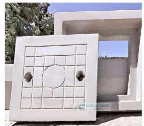
COVER 1 WITH FRAME