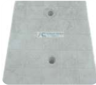
750mm x 600mm COVER SLAB ACPDC07 ~750mm (L) x 600mm (W) x 100mm (T) (Wet-cast product)