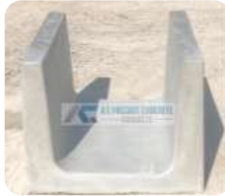
LARGE U DRAIN ACPD02

Suitable for gutter and cable ways/cable/pipe shield