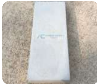
SMALL U DRAIN COVER ACPDC01

(Suitable for use with Kerb - sold separately)