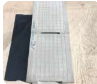
RCC GRIP COVER WITH SLITS ACPDC03

490mm (L) x 205- 210mm (W) x 50mm (T) Suitable for ACPD01 Small Drain