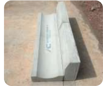
SAUCER DRAIN ACPD05