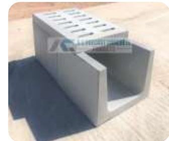
RCC SLOTTED COVER ACPDC02