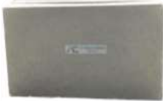
800mm x 500mm PLAIN SLAB ACPDC05 ~800mm (L) x 500mm (W) x 95mm (T)