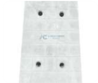
900mm x 600mm COVER SLAB ACPDC09 ~900mm (L) x 600mm (W) x 100mm (T) (Wet-cast product)